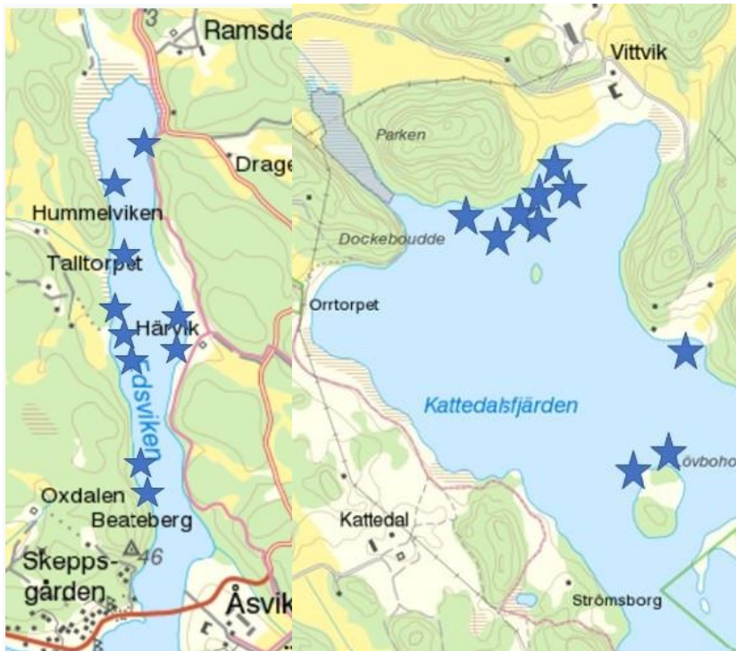
Figure 2. Location of the artificial reefs. To the left, Edsviken and to the right, Kattedalsfjärden

By filming the artificial reef, we have seen that it works well, and a lot of fish gathered around the spruces.